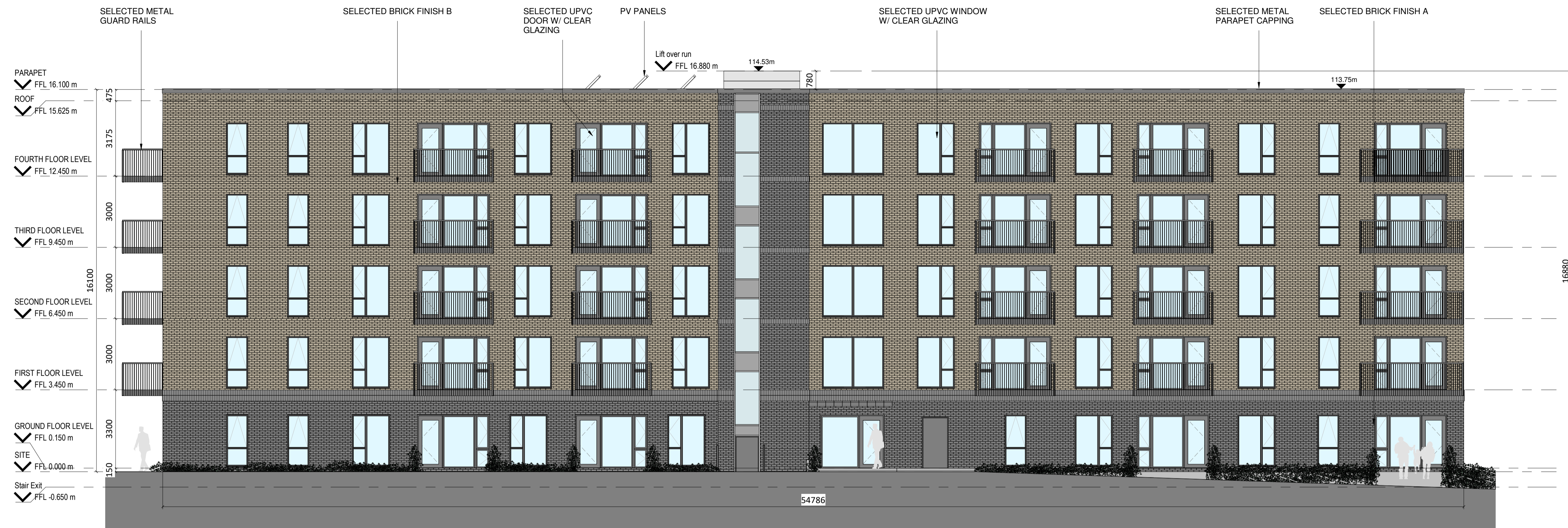
1 BLOCK A - EAST ELEVATION 1 : 100