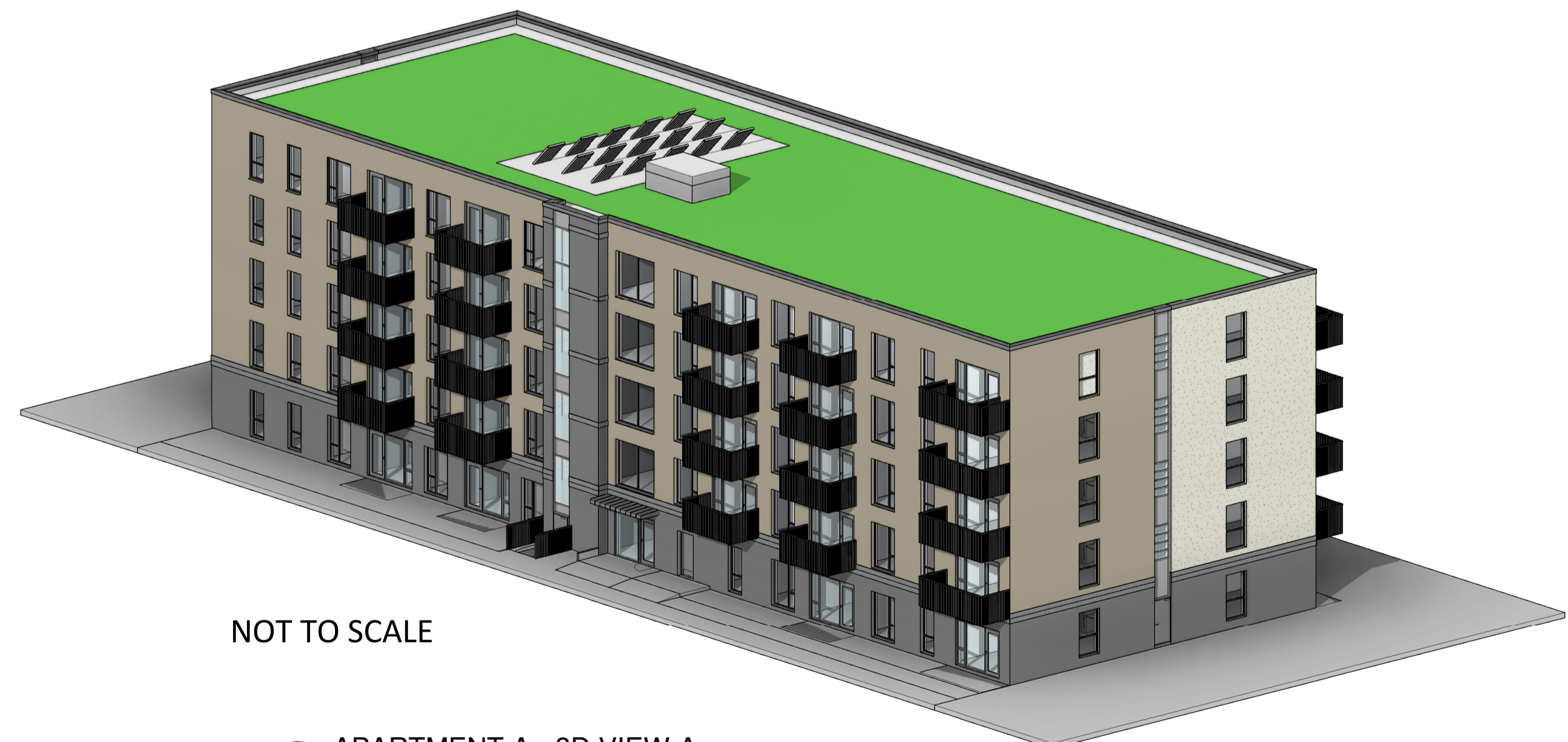
2 APARTMENT A - 3D VIEW A